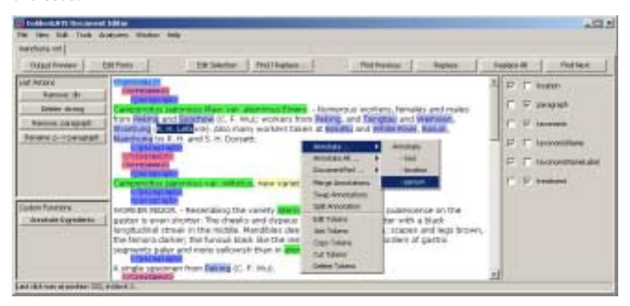
Figure 1. The annotation editor.

Markup Creation: To mark up a sequence of words with an XML tag, the user can simply select the words in the document and use the Annotate function in the context menu. The editor then prompts for the element name and does the rest automatically. To reduce the editing effort further, the context menu provides the most recent element names for instant reuse. Changing the name of an element works similarly, the user does not need to modify start and end tag separately. The same is true for removing the markup around some text, or removing a marked up document fragment, i.e., both the tags and the text enclosed.