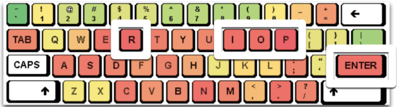
Figure 2: Color-coding keys by their defect correlation; (red = strong). The five strongest correlations are highlighted.