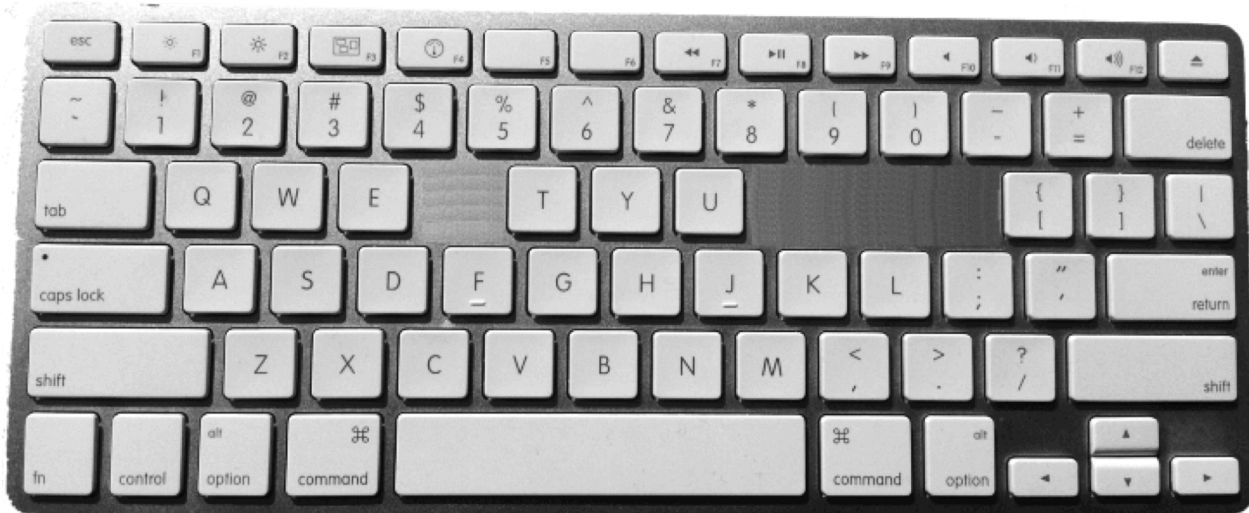
Figure 4: Avoiding risky actions with the IROP keyboard

keywords in programming languages. Our interns quickly came up with appropriate replacements, though. C# code such as